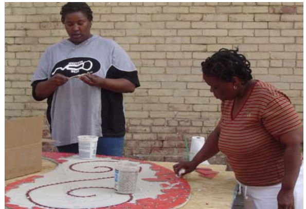
FAN staff and youth work on the new MLK Avenue Mural