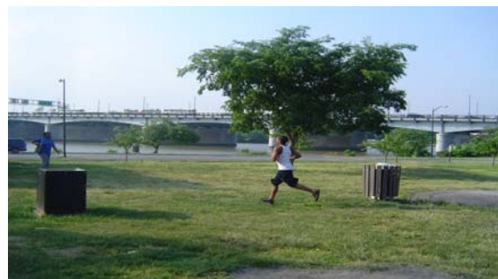
Water fight at Spring Closing Picnic

Keep you in my heart while you guide me though the light the sun is beaming while my heart is screaming now I see you out of my life while I cry its day so look me up when I am eighteen look for me to say rest in peace now I see the time going fast tic toc I will see you later dropping tears from your spirit now I am saying daddy come back and then I cry of sadness now you hear me sing rain on me and then I am singing to the left I see you in you coffin I am shedding tears on your face only you understand how much time we spend together.